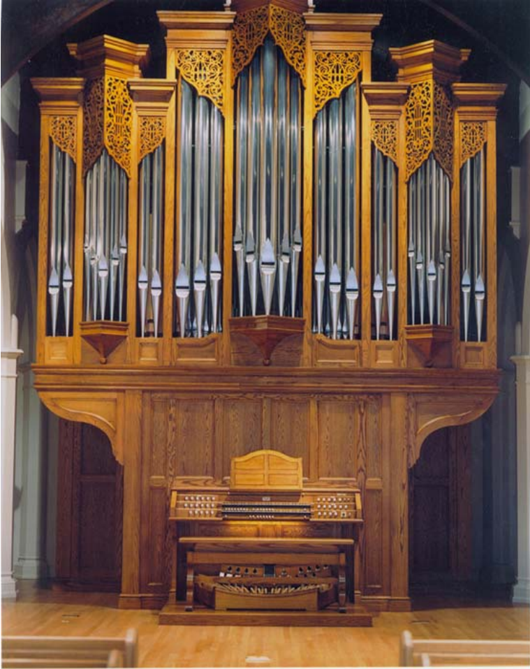
Lively-Fulcher Organ (1998), St. Mary's Episcopal Church, Arlington

December 6 at 5:00 PM - Religious Service: Festival of Nine Lessons & Carols by St. Mary's Choirs. St. Mary's Episcopal Church, 2609 N. Glebe Rd., Arlington, VA 22207, 703-527-6800. www.stmarysarlington.org