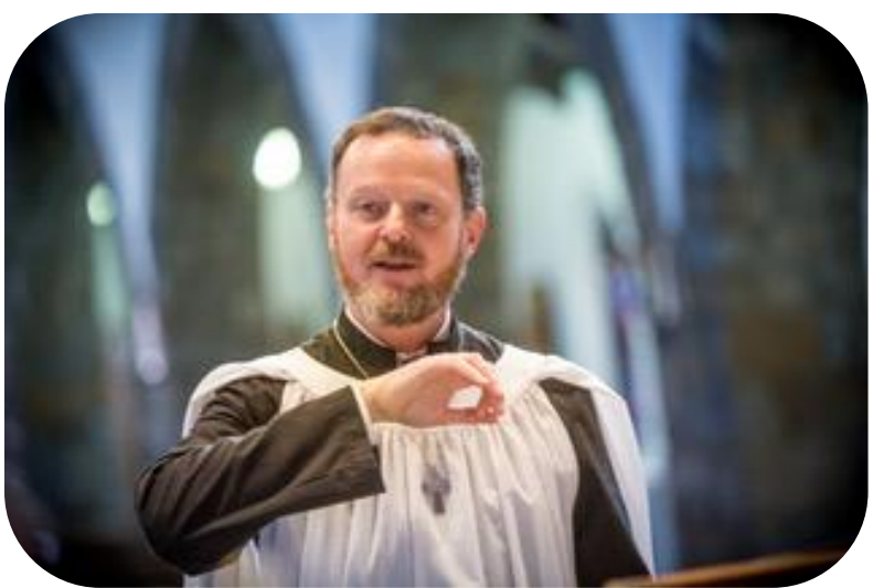
Going where the Spirit leads