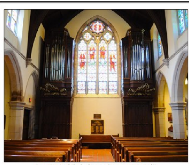
Opus 50 • Good Shepherd Episcopal • Lexington, KY • IV/58

There is safe, free, and ample parking available at the Franciscan Monastery.