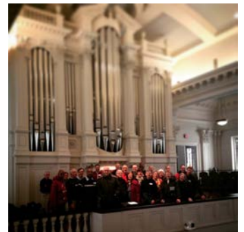
Gathered in front of the organ of St. James

On February 16, members of the District of Columbia Chapter enjoyed a trip to Richmond, Virginia as part of their annual Presidents' Day Road Trip event. Members had the chance to see, play, and visit four unique instruments. During the morning hours, the group visited Saint Bridget Catholic Church (John-Paul Buzard organ) and Saint Benedict Catholic Church (Pasi organ). Following lunch at the Richmond Museum of Fine Art, the group traveled to Saint James Episcopal Church (C.B. Fisk organ, pictured) and Saint Paul Episcopal Church (Rosales organ). This annual event has become a favorite among members and, despite the slow drive back to DC in the snow, a good time was had by all! Stay tuned for details on next year's road trip!