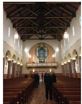
View of the organ from the front of St. Benedict's