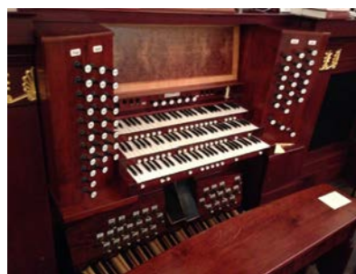
Rosales console at St. Paul's