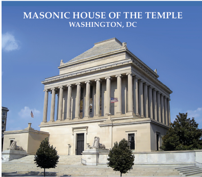
MASONIC HOUSE OF THE TEMPLE WASHINGTON, DC

A full-line representative for pipe, digital, and hybrid organ solutions.