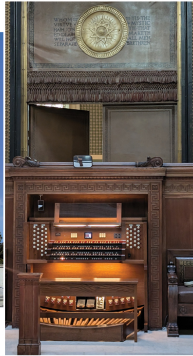
Custom Rodgers console with Pau ferro drawknobs and reverse color wood keys. A hybrid instrument with a newly rebuilt Schantz organ with 22 ranks of pipes